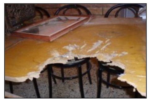
Kitchen table where the Purim basket was opened