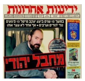
Yediot Aharonot 11-2-09

Across Israel – for those who have heard the reports – there is shock and disbelief that the terrorist attack on a 15-year old Jewish boy in Ariel in March 2008 may have been a case of Jewish terrorism. It is a hard concept for Jews to accept – a horrific act of Jew-on-Jew terrorism. Having been the victims of such acts throughout the annals of history, to believe that Jews could become exactly like their persecuting enemies is almost unthinkable to most Jews. The unthinkable is not softened by the cold insistence from some that the targeted family is "not really Jewish" because of their faith in Yeshua (Jesus).