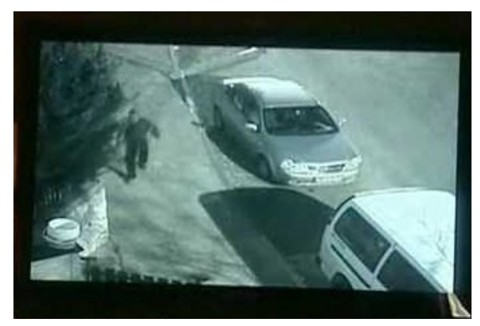
One of the street views of the Ortiz security system

The science behind this investigative tool should provide some of the strongest evidence Israeli authorities have in possession for any of the cases against Yaakov Teitel. It should also guarantee that prosecutors will not set aside or attempt to exclude the attempted murder charges in Ami's case as unnecessary to make their case against Teitel.