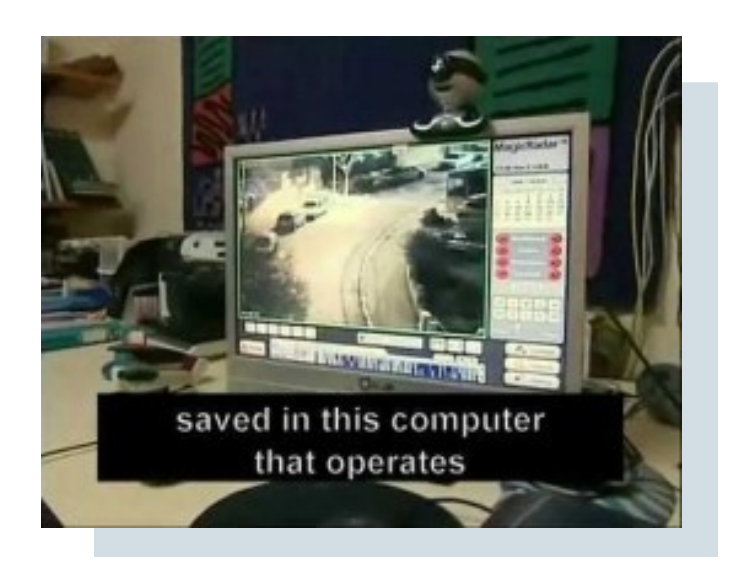
Clip from the Uvda special demonstrates the street view coverage of the Ortiz' motion sensor security system of the kind many Israeli ministries now employ for personal safety.

In the first days after the bombing when the mayor of Ariel visited the family, he was able to inform them that the investigation of the attack had been moved to a higher-level department in Jerusalem. As the family understood it, the move was to avoid any local conflicts of interest that may exist locally.