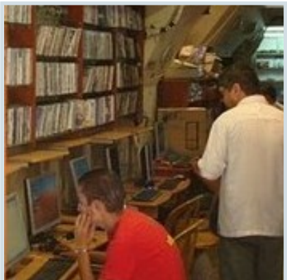
An example of an Old City internet café'