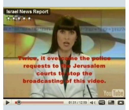
Click <u>here</u> for the video with English translation subtitles.

the Beckford's said any such thing.<sup>39</sup> Overall, the press coverage is in a surprisingly positive tone.