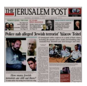
Jerusalem Post 11-2-09