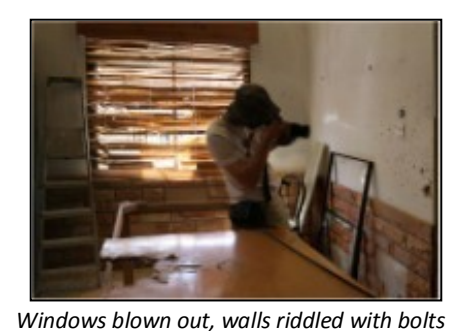
williaows blowli out, walls fladied with bolts