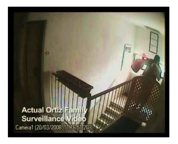
Anyone else struck by this surveillance photo that bears an uncanny resemblance to the famous scene in Schlindler's List of the girl in the red coat?

don't have too many fans in this country. If you are Messianic Jews, you are not going to have too many friends. The law protects you, but you don't have too many people behind that law giving you favor."