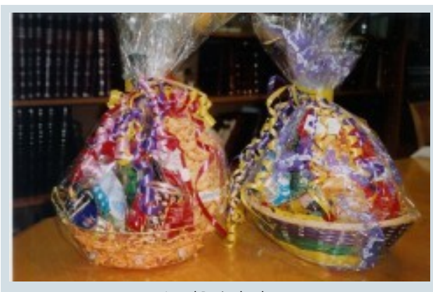
Israel Purim baskets

from the U.S. with minimal command of verbal or written Hebrew<sup>4</sup>.